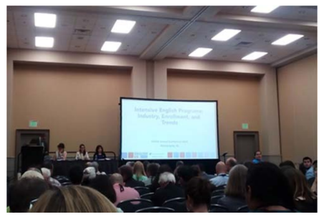
The session "Intensive English Programs: Industry, Enrollment, and Trends"