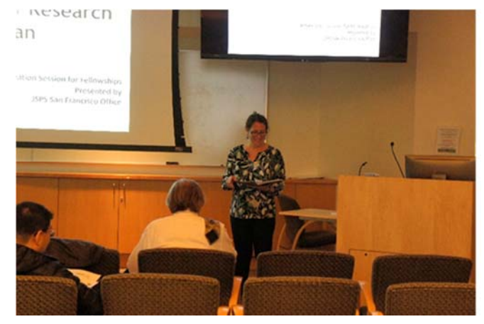
Opening Remarks at UC San Diego

JSPS San Francisco will continue to hold regular networking info sessions at universities in California. All interested researchers are welcome to attend. For more information about upcoming info sessions, as well as fellowship eligibility, and other details, please contact the JSPS San Francisco Office: fellowships@jspsusa-sf.org or visit us at our website: <a href="http://www.jsps.go.jp/english/e-fellow/">http://www.jsps.go.jp/english/e-fellow/</a>