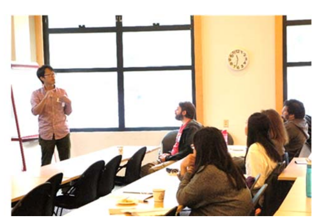
Alumni Talk at UCSC