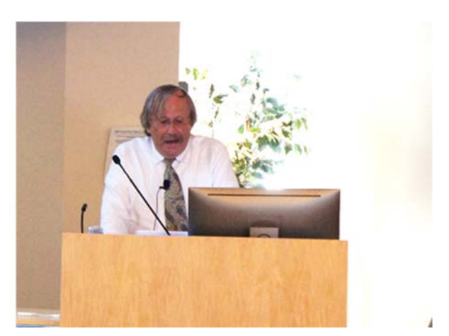
Alumni Talk at UCSD