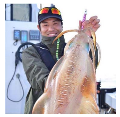
"My target species Big-fin reef squid caught in Yaku-shima Island in Japan."

Currently, Satoshi is using genetic approaches to understand dispersal and connectivity of reef squid, one of the most expensive and delicious squid in Japan (see the picture below), and throughout the West Pacific Ocean.