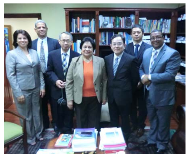
At the office of Ministerio De Educacion Superior Ciencia y Technologia (MESCYT) (Ministry of Higher Education Sciences and Technology in English). We visited the MESCYT office on February 2013, and met with the minister (middle).