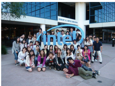
Field trip at Intel

One of the main goals of Kyushu University California Office (CA Office) is to expose students to different ideas and cultures through various programs and to bring as many students as possible to Silicon Valley or, otherwise, to the USA. In order to achieve such an objective of internationalization, this summer, CA Office hosted an English training program, called Silicon Valley English Program (SVEP). This is the fourth SVEP we have conducted.