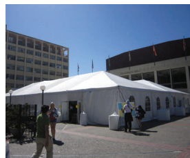
Outside of the Fair →

On September 24 th , which was a hot day for Berkeley, University of California at Berkeley held a Study Abroad Fair. Lots of UCB students who are interested in studying abroad attended this one day event.