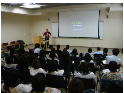
Field trip at Stanford University

In addition to the classes, we took them out for field trips to neighboring universities and companies in Silicon Valley. We visited Stanford University, Cisco Systems Inc. and Intuitive Surgical Inc. which developed a robotic-assisted surgery called DaVinci. Students found the visits interesting and exciting because they learned the work styles and innovative technologies of the companies.