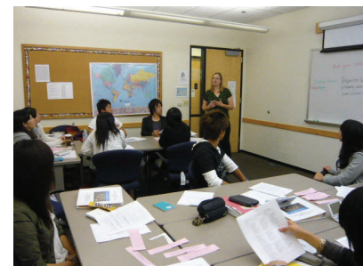
An English Class at SAL

In late August, 42 Kyushu University (KU) students came to Silicon Valley to study English at "Studies in American Language (SAL)" in San José State University (SJSU). SJSU has an exchange agreement with KU and this program is customized for KU. Students were deeply immersed in English for four weeks in both their classes and home stays.