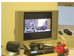
During the lecture.

Two other Japanese universities, Kagoshima University and Kyushu University, also have long distance live lectures from their own Bay Area's office.