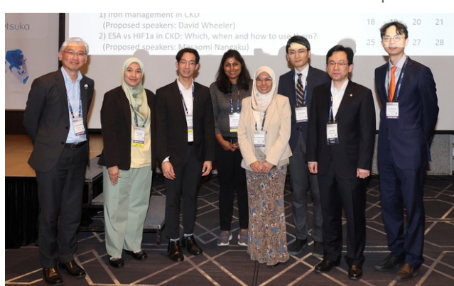
KSN/APSN Joint Symposium on interorgan crosstalk held in Seoul, Korea (2023).