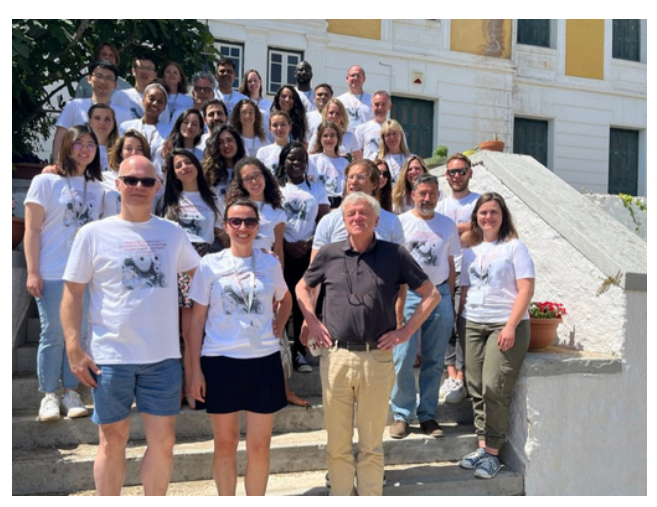
EMBO | FEBS Lecture Course held in Spetses, Greece (2022).

Although I have spent most of my career in the Tokyo metropolitan area, I noticed that, with sufficient resources, researchers do not necessarily stay in the most populous regions of a country. St. Louis provides a nice and affordable living environment with a warm and friendly community that embodies the pioneering spirit of the Midwest.