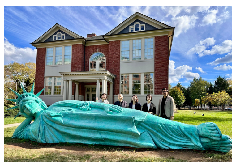
Members of JSPS Washington Office

In additional news, the Washington Office is the Secretariat of the U.S.-Canada JSPS Alumni Association and its regional Chapters. In recent years, the <u>Capital Chapter</u>, The GULF States Chapter, and the <u>Quebec Chapter</u> have been established. There are plans to form more chapters in various regions in the future.