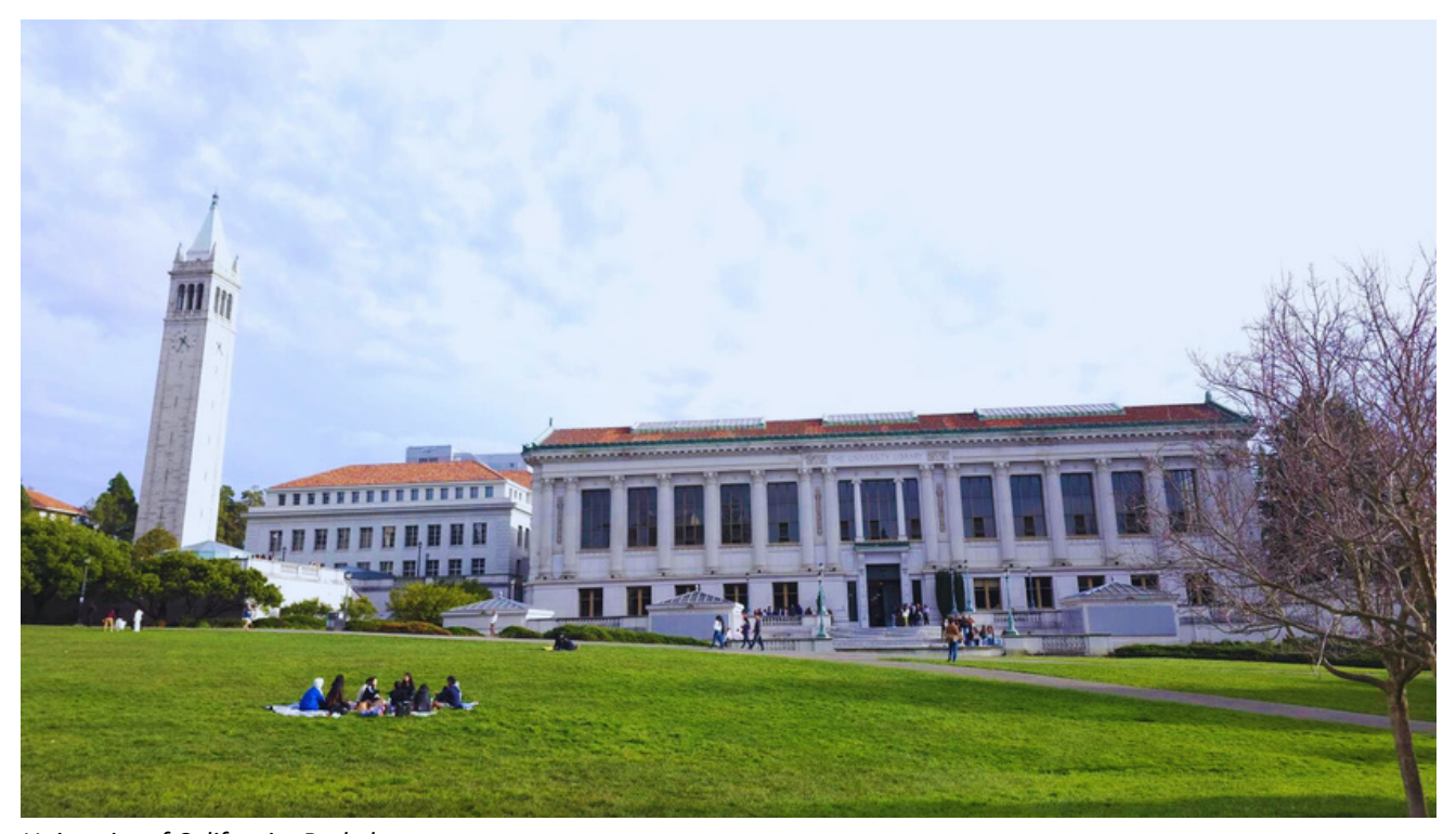
University of California, Berkeley