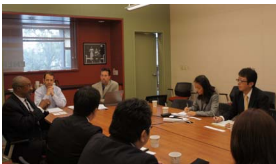
Meeting with Procurement Office

MEXT proceeds to take measures to prevent the improper use of research grants, taking into consideration the information and knowledge gained from this visit.