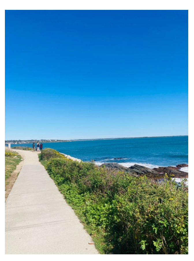
Newport, a popular destination in Rhode Island

My current final career goal is to become an independent researcher in the academic field in Japan. Conducting research here broadens my expertise, providing me with hands-on experience in studying embryonic development from various perspectives. At the same time, I hope I can be a good role model for female scientists and contribute to solving the problem of the small proportion of women scientists in Japan. Further, I believe implementing beneficial US systems into academia in Japan would allow students to gain a greater interest in science. After I get an academic position in Japan, by sharing my experiences, I will aim to encourage students to study abroad and help them grow as researchers who can succeed on the world stage.