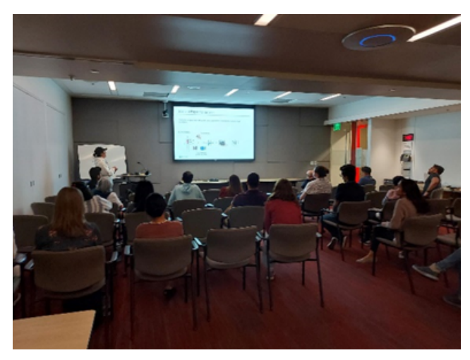
Weekly Lab meetings are held jointly by the five labs in the Prostate Cancer Research Group.