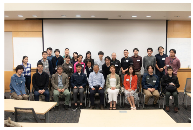
BAS's New Year Seminar

I was invited to the Japanese San Francisco Bay Area Seminar (BAS)'s New Year Seminar held on April 29th, and gave a lecture entitled "Significance of the Defense Mechanisms against Oxidation of Nucleic Acids by Reactive Oxygen Species in Aging: from Carcinogenesis to Alzheimer's Disease." I also had an opportunity to introduce the activities of the JSPS SFO. On August 26th, I was also invited to the BAS-sponsored BBQ event in San Francisco, where I enjoyed barbeque and networking. This gathering made me realize that no matter how advanced technology becomes, the importance of human connections will never go away.