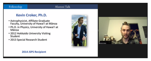
University of Hawai'i at Mānoa

For more information about upcoming info sessions, please visit our <u>website</u> or contact us directly. https://www.jspsusa-sf.org/