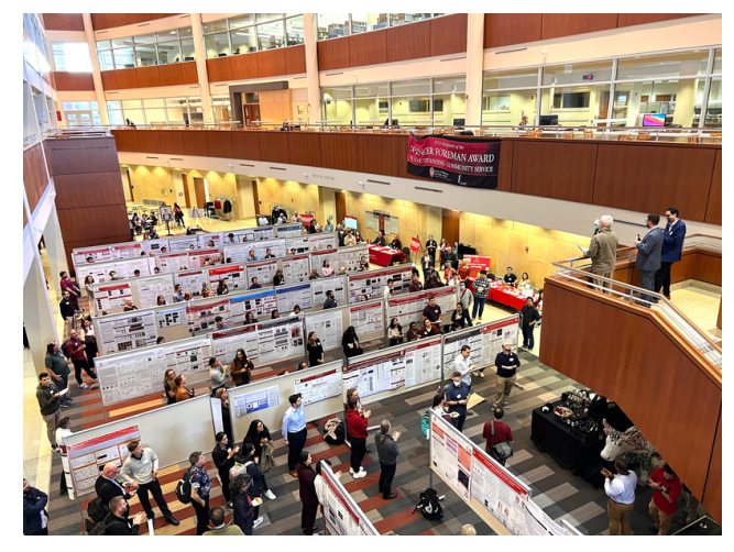
Global Health Symposium 2023 held at the Health Science Learning Center in Madison. Wisconsin

My experience in the U.S., a blend of the novel and the universal, has enriched my research and my perception of the scientific community. It has shown me that the thirst for knowledge transcends boundaries, and that the pursuit of understanding is indeed a universal human endeavour.