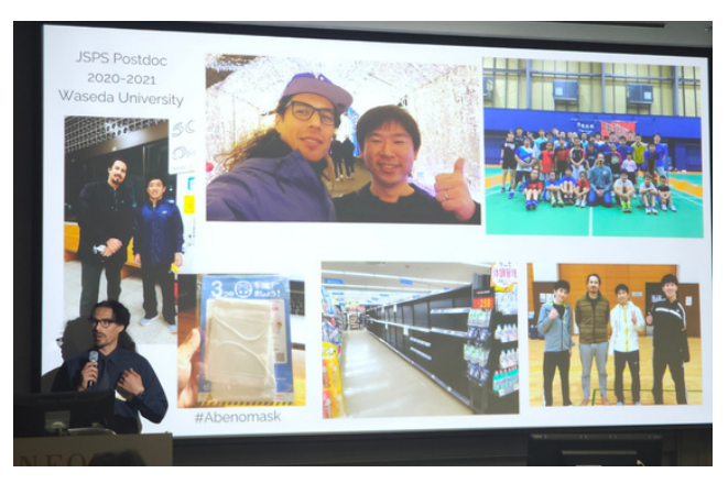
Presentation by JSPS alumni

JSPS will continue to strive to connect with other organizations to encourage research and network between the U.S. and Japan.