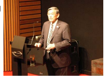
Norman Mineta, Former US Secretary of Transportation

On 9-11 October, the JSPS San Francisco office supported an international meeting on the theme "Japan and Japanese America: Connections Across the Pacific Rim," sponsored by University of California, Berkeley's Center for Japanese Studies and held by the David Brower Center. At the meeting, experts from the U.S. and Japan discussed from a historical perspective the connectivity between Japan and the Japanese-American community. Meant to deepen understanding of the mutual relationship between Japan and the United States, the meeting's discussion was opened to both researchers and interested members of the public in the U.S.